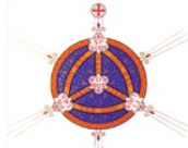
Holy Trinity Hethe

The Parishes of the Immaculate Conception & Holy Trinity are part of the Archdiocese of Birmingham: Registered Charity No: 234216